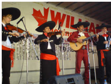
Live music will be held in a single stage at the corner of Main Street and Broadway on one weekend, and at 14th Ave. the next weekend!

The first Main Street Car-Free Day will close off Main Street from 12th to 16th Avenues on June 15, 2008 , from 3:00-10:00pm.