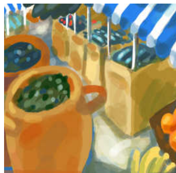
BIA Members like street events, based on the February 2008 survey. A Farmers' Market was given the highest priority.

R enewal Meetings are part of the process for extending the Mount Pleasant BIA mandate by another 5 years. There are two BIA Renewal Meetings in 2008.