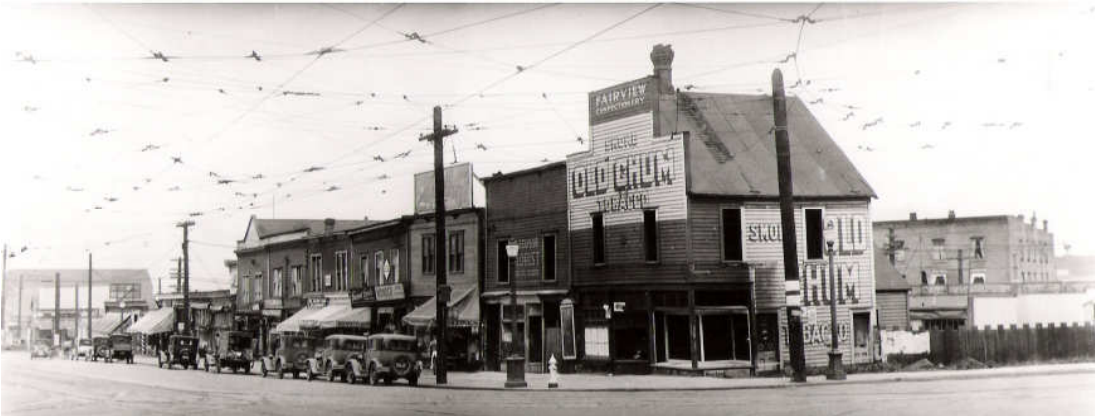
Left, 1927: Main Street and Broadway (Northeast corner) still uses wooden structures even as the street has converted to concrete and asphalt. In this photo, the Old Chum Tobacco store dominates the corner, though it appears to have had a fire.