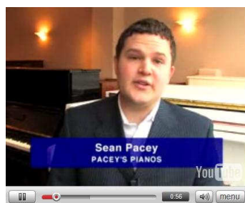
See and hear what businesses have to say about fairness of property taxes at www.mounpleasantbia.com