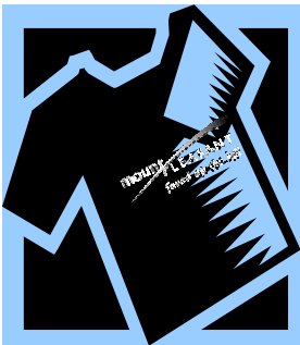
You could win a T-shirt.

Mount Pleasant Community Planning has wrapped up the work of its heritage working group. Another committee, the Community Liaison Group will also be finishing soon. A third focus will be on Mount Pleasant's shopping area, commencing with a workshop on April 20, 2008. (See insert)