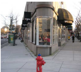
Above: Gene Coffee Bar Right: Red Pepper Deli