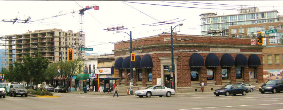
Right, 2008: The structures on Kingsway dwarf the lower buildings on Main Street. The 1 Kingsway development nearing completion has changed the skyline looking north to the mountains. Tobacco stores now occupy the smallest retail spaces, and the City vows to become smoke free.