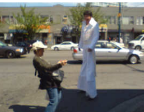
A tall Elvis and a man hamming it up. Such silliness occurs at the Celebrate Mount Pleasant Festival, which is on Saturday, June 7, 2008 this year.

An Autumn Farmers' Market will be held for a few Tuesday afternoons at the parking lot of Main Street and Broadway from September to October 2008.