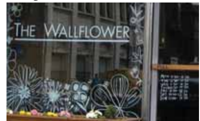
The Wallflower Cafe 2420 Main St.