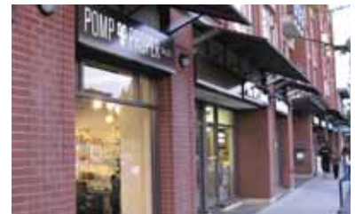
St. Pomp & Proper Salon 2812 Main