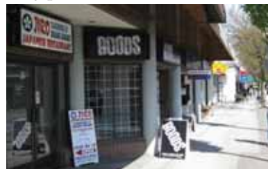
The Goods Apparel 335 E. Broadway