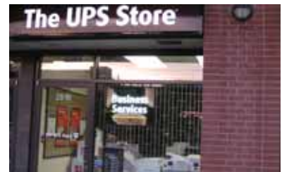
The UPS Store 2818 Main St.