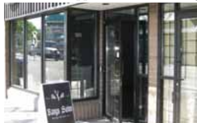
Bangs Salon 351 E. Broadway