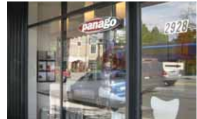
Panago Pizza 2928 Main St.