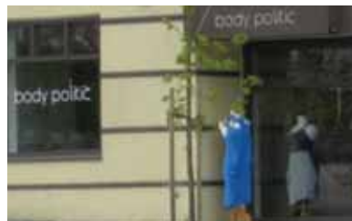
body politic 208 East 12th