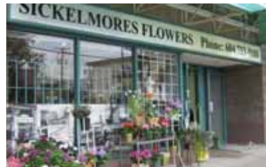
Sickelmores Flowers 198 East 15th